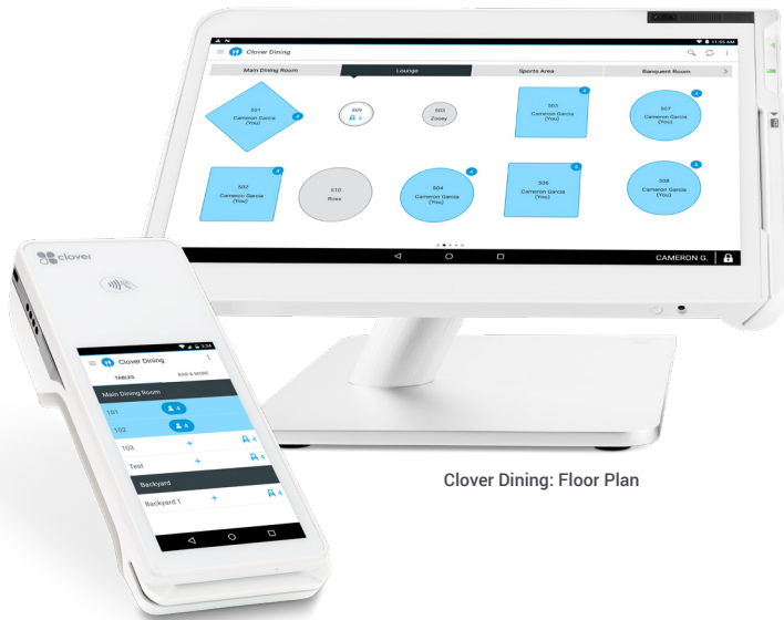
Clover Dining: Floor Plan

Core features you need. Enhancements you'll love. Master customer delight with Clover Dining.