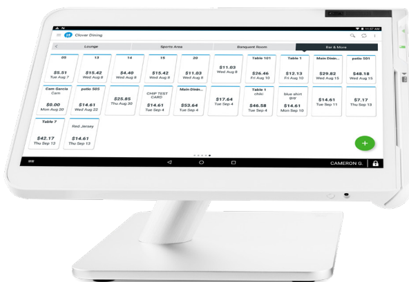
Clover Dining: Floating Orders

More powerful data with every customer served